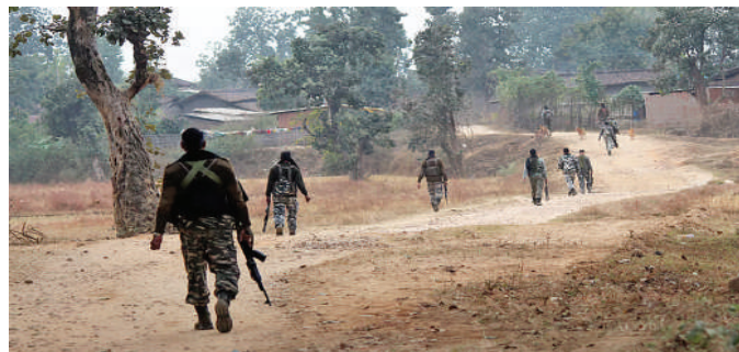
The Maoists had earlier proposed a ceasefire to the government. However, the Centre intensified its operations against them

Deputy Chief Minister Vijay Sharma said the best way for Maoists is to surrender and avail rehabilitation benefits.