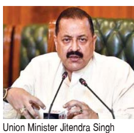
Union Minister Jitendra Singh

He said platforms such as Mission Karmayogi (for Government employees capacity building), CPGRAMS (Centralised Public Grievance Redress and Monitoring System), Digital Life Certificate (for pensioners) and other technology-driven governance systems have demonstrated how reforms can improve the life of citizens while enhancing transparency, accountability and efficiency, and