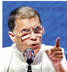
Congress leader Pawan Khera

the name of the US Indo-Pacific Command to the US Pacific Command, reversing an eight-year-old decision. The US Department of Defence announced the decision on Tuesday, stating that the designation honours the Command's deep historical roots, established in 1947 by then-President Harry Truman.