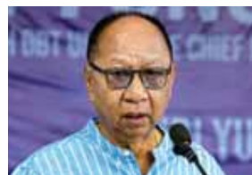
Manipur CM Y Khemchand Singh

Jan Kalyan Shivir (Public Welfare Camp) held at Chingamathak here, Singh stated that the camp is being organised to ensure the doorstep delivery of various Government welfare schemes