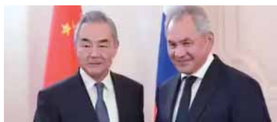
Russian Security Council's Secretary Sergei Shoigu, China's FM Wang Yi