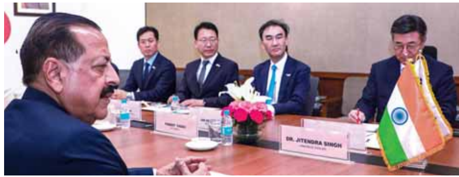
MoS Jitendra Singh holds a bilateral meeting with South Korean minister Yoon Ho-joong in New Delhi