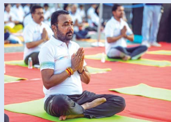
Union Minister of Ayush (Ministry of Ayurveda, Yoga and Naturopathy, Unani, Siddha, and Homeopathy) Prataprao Garpatrao Jadhav (PTI)