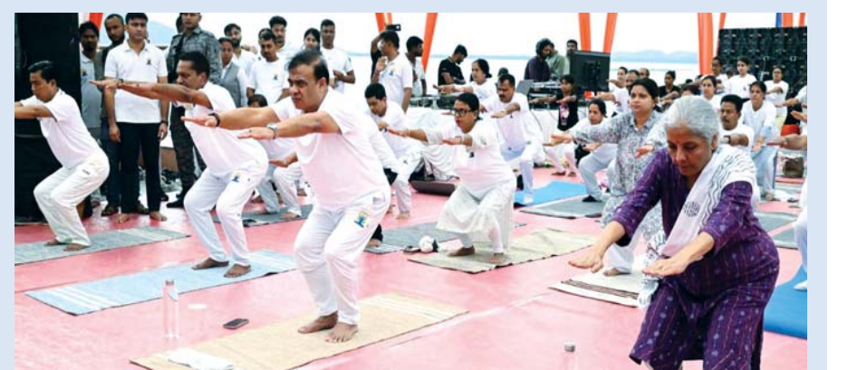
Assam Chief Minister Himanta Biswa Sarma along with Union Minister for Finance and Corporate Affairs Nirmala Sitharaman attending International Day of Yoga programme in Guwahati