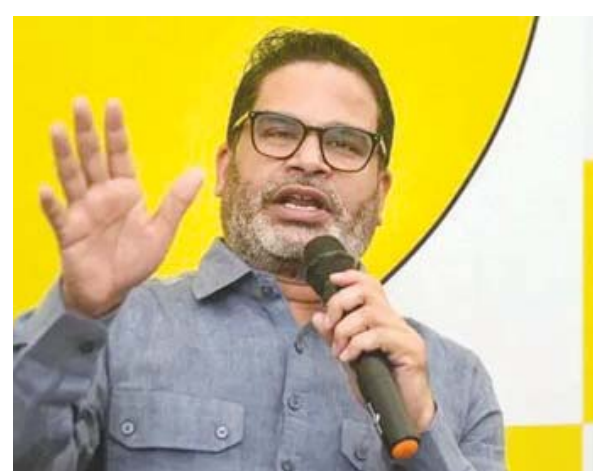
Founder of Jan Suraaj Party Prashant Kishor