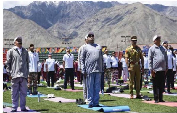
Vice-President CP Radhakrishnan along with Ladakh LG Vinai Kumar Saxena performing yoga at Spituk Stadium in Leh, Ladakh