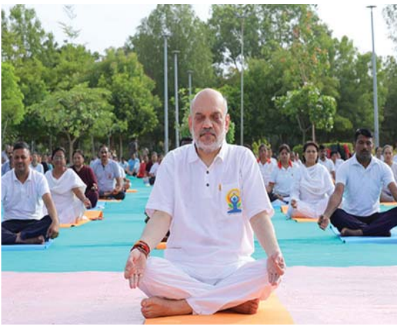
Union Home Minister Amit Shah during a yoga session on the occasion of the International Day of Yoga in Ahmedabad

"Yoga is India's invaluable gift to humankind, which nourishes holistic well-being through energising mind, body and soul.