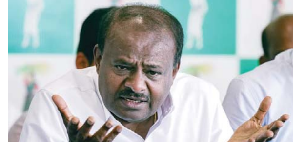
Union Minister of Heavy Industries and Steel HD Kumaraswamy addressing a press conference in Bengaluru, Karnataka.

However, citing prior commitments, Kumaraswamy had sought to reschedule the meeting to June 27, proposing the discussion be organised at a suitable venue in Bidadi or Byramangala instead of Vidhana Soudha, aiming to give affected farmers and villagers an opportunity to participate. Meanwhile, reacting to