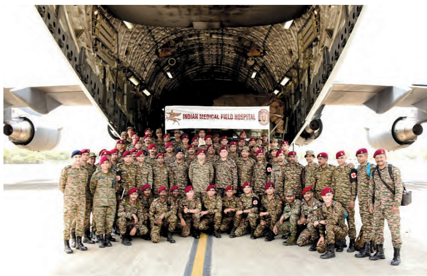
A 41-member team of the Indian Army, from the 60 Para Field Hospital, including nine medical officers, being deployed in Venezuela to support humanitarian relief efforts as part of 'Operation Amistad'.

In a gesture of solidarity with the people of the Bolivarian Republic of Venezuela, India has launched Operation Amistad, a humanitarian assistance and disaster relief (HADR) mission, in response to the devastating earthquake that has caused extensive loss of life, injuries and widespread destruction. "Operation Amistad underway! Two @IAF_MCC C17s took-off today for Venezuela with urgent assistance to support their post-earthquake relief efforts. The assistance contains an Indian Army @adgpi Field Hospital Unit and over 35 tons of relief supplies, medicines and medical equipment, including two BHISHM cubes. India is committed to supporting the government and people of Venezuela in