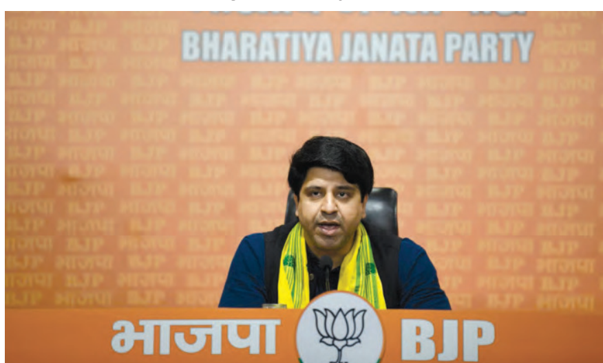
BJP national spokesperson Shehzad Poonawalla

Poonawalla further claimed that the opposition parties question the electoral process to create doubt in the minds of voters and use these allegations as an alibi to escape accountability. "They are only trying to create doubt in the minds of voters and use these allegations as an alibi to escape accountability. In reality, they also know that the EVMs are working perfectly well," he said. Poonawalla claimed the latest figures on EVM verification requests exposed the Opposition's