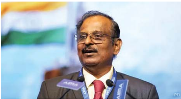
ISRO Chairman V Narayanan

"We have developed a cryogenic rocket engine, the technology which