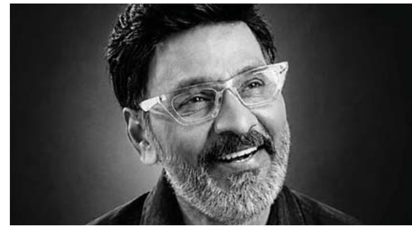
Tamil filmmaker and actor K Bhagyaraj