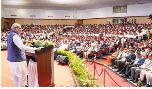
VP CP Radhakrishnan addresses a gathering during the 517th birth anniversary celebrations of Nada Prabhu Kempegowda in Bengaluru

Addressing the 517th birth anniversary celebrations of Nada Prabhu Kempegowda, the founder of Bengaluru city, at Jnanajyoti Auditorium in Bengaluru, the Vice President said the Centre had already begun discussions on river interlinking and expressed confidence that the initiative would be imple-