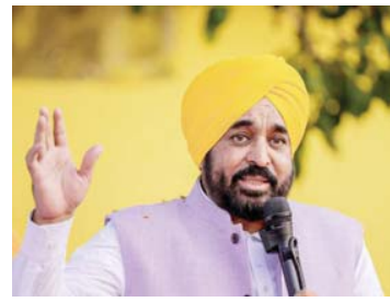
Punjab CM Bhagwant Mann

The notification was issued by the Department of Rural Development and Panchayats.