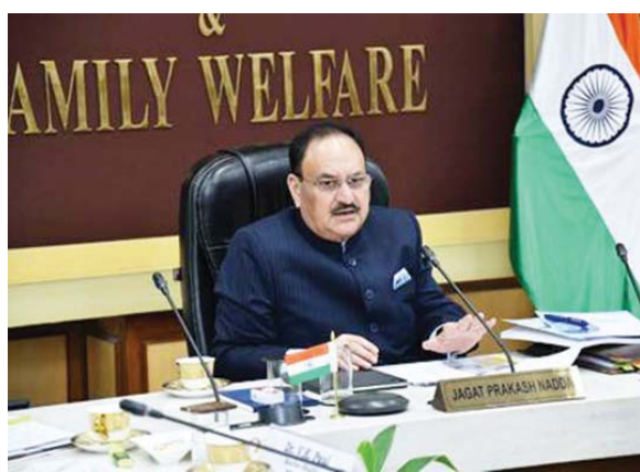
Union Health Minister JP Nadda

The revised guidelines transform the existing Anaemia Mukht Bharat programme into Anaemia Mukht Bharat Abhiyaan, expanding its focus beyond iron supplementation to include early testing, therapeutic management, healthy dietary practices, digital tracking and community participation. A key feature of the new guidelines is the introduction of a 7x7 strategy, replacing the earlier 6x6 framework.