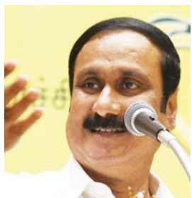
PMK leader Anbumani Ramadoss

Government has introduced sweeping modifications to the Mahatma Gandhi National Rural Employment Guarantee Act (MGNREGA), which previously guaranteed 100 days of work, he said. "The new 125-day employment program is scheduled to come into effect from July one."