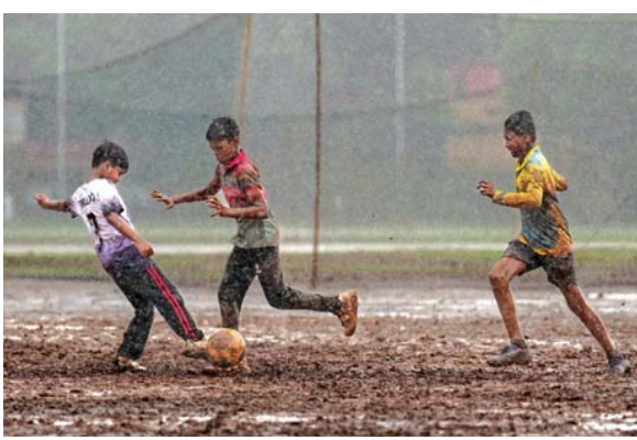
Children play football on a rain-soaked ground during monsoon showers in Mumbai on Tuesday

It is likely to continue its movement over some more parts of Uttar Pradesh, Uttarakhand, some areas of